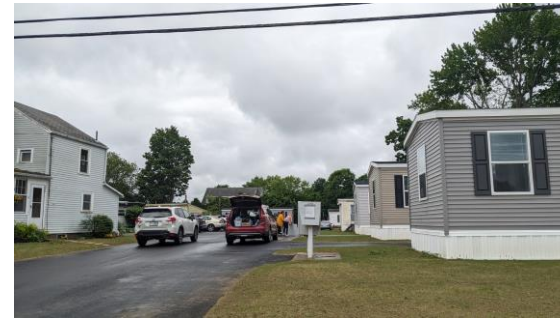
Woodbury Avenue Portsmouth