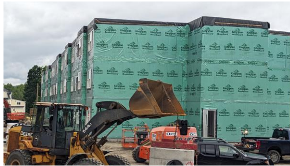
Spring Street Apartment Newport