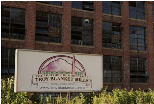
Troy Historic Mill Conversion Troy