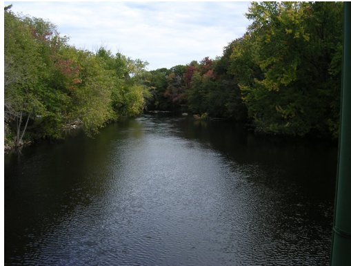
A view of the Suncook River from the Pembroke/ Allenstown Double Decker Bridge

The State of New Hampshire established the Rivers Management and Protection Program (RMPP) in 1988 under RSA 483. The RMPP provides a two-tiered approach to river management and protection: State designation of significant rivers and protection of instream characteristics, and local development and adoption of river corridor management plans to protect shorelines and adjacent lands. The RMPP is administered by the Department of Environmental Services (DES).